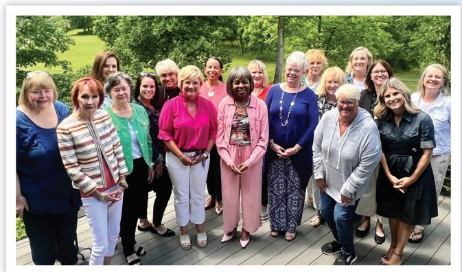
The Women's Board Executive Committee